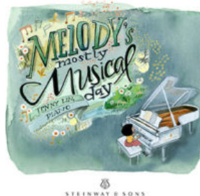
Melody’s Mostly Musical Day