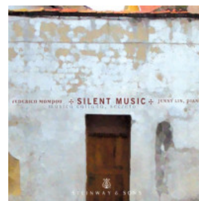
Silent Music – Mompou