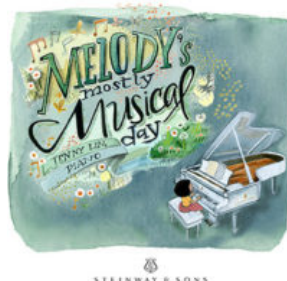
Melody’s Mostly Musical Day