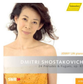
24 Preludes & Fugues – Shostakovich