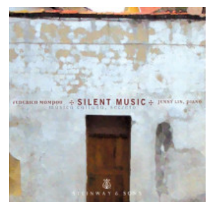
Silent Music – Mompou