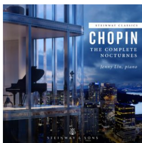
Chopin The Complete Nocturnes