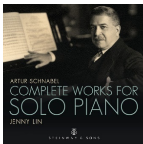
Artur Schnabel: Complete Works for Solo Piano