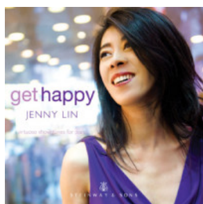
Get Happy – Showtunes for Piano