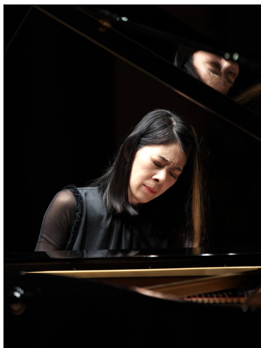
Photo Credits (Left to Right)